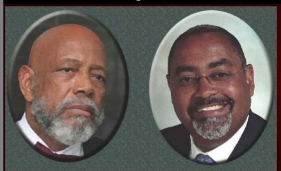
MCLE: 14.5 (Day 1: 7.5 Day 2: 7.0) Ethics: 2.0 (1.0 each day) Breakfast & Lunch provided each day

Thurgood Marshall School of Law, 3100 Cleburne St., Houston, TX 77004