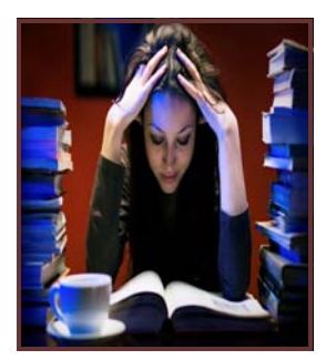
As you study for finals, you are not alone! Reference librarians can point you to study aids.

After acing your exams, you are welcomed to visit the library during the holiday season. We are open Monday through Friday from 8 am and 5 pm (Dec. 12—22, 2008 and Jan. 2—9, 2009). All hours are subject to change. Please visit or call the circulation desk for upto-date hours of operation.