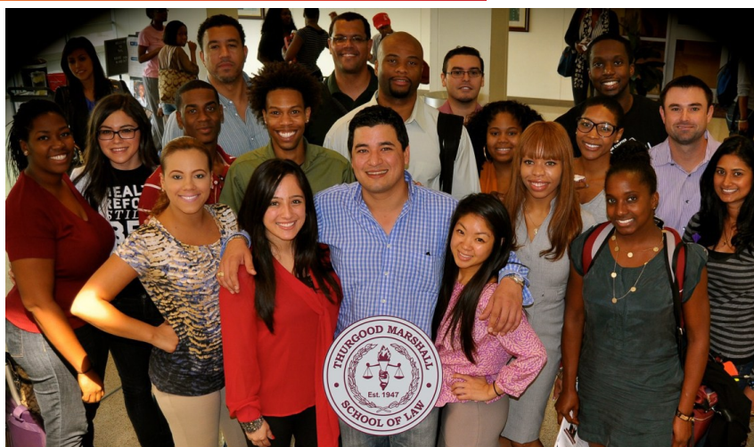
THURGOOD MARSHALL SCHOOL of LAW AN EXAMPLE OF DIVERSITY IN HIGHER EDUCATION "Protect It, Improve It, Pass It on"