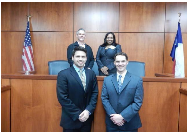
1 st Place winner – Texas A & M University School of Law