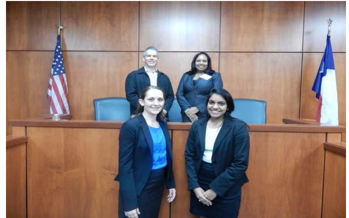
2 nd Place Winner – University of Houston Law Center