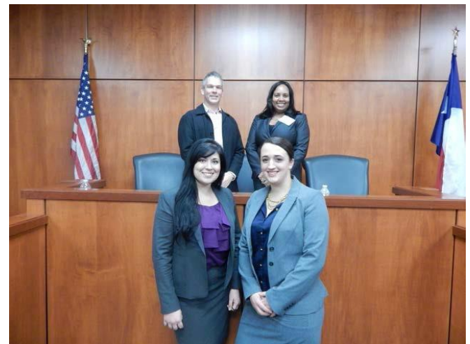
3 rd Place Winner –University of Colorado Law School