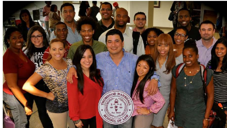
THURGOOD MARSHALL SCHOOL of LAW AN EXAMPLE OF DIVERSITY IN HIGHER EDUCATION "Protect It, Improve It, Pass It on"