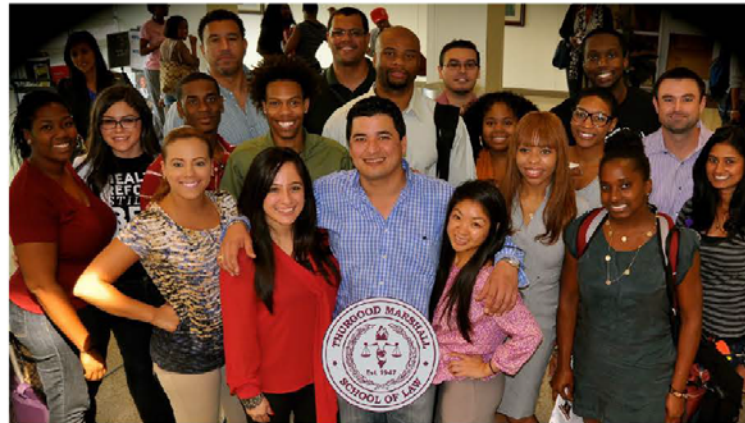
THURGOOD MARSHALL SCHOOL of LAW AN EXAMPLE OF DIVERSITY IN HIGHER EDUCATION "Protect It, Improve It, Pass It on"