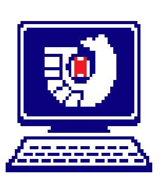
TMSL is a Federal Depository