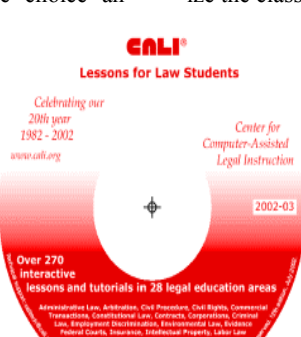
CALI Interactive Lessons for Law Students

The format of the individual lessons varies according to the objectives of the author. Some authors use a simulated trial to provide students with an opportunity to test their understanding of an area of law. Other