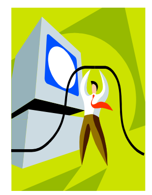
ProDoc is a great tool for practitioners and students alike.

"Love may be in the air during this time of year, but the law's interaction with love and marriage is not always romantic."