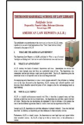
Pathfinders may also be accessed via the law library's webpage.

"Love may be in the air during this time of year, but the law's interaction with love and marriage is not always romantic."