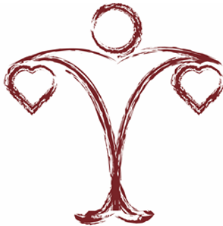
EARL CARL INSTITUTE JUVENILE JUSTICE PROJECT

The link to the investigative report can be found here: http://abc13.com/news/lunchroom-lunacy-isd-cops-investigate-fake-money/1314203