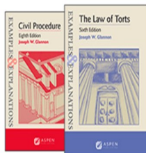
Examples & Explanations