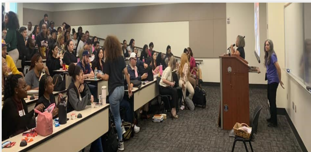
Brown Bag Session “Embracing the Journey” on September 5, 2024

You can find the recordings of these events on the Law Library's Events-Instructional Programs page.