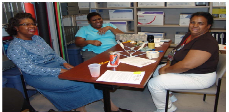
TEAMWORK Staff works at "Building Bridges"

The members worked through a series of games including building bridges from hangers to help them focus on the attributes of true TEAMWORK to Take Our Team to the Next Level.