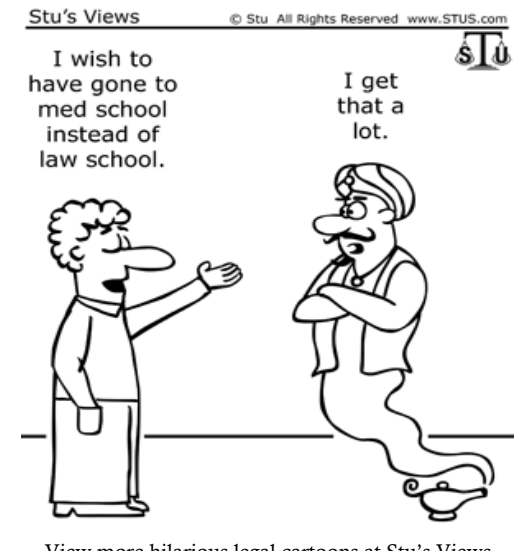
View more hilarious legal cartoons at Stu's Views Law & Lawyer Cartoons, http://stus.com/.