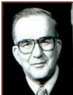
Photo of the Honorable Myron H. Bright

Leal were instrumental in uniting all officials to implement the project, which took a little over a year to materialize. Be sure to visit the law library's elevator lobby, where the collection is on display until the end of December.