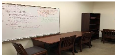
Group Study Room