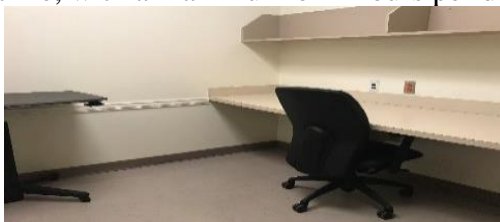
Individual Study Room

There are 16 individual and 1 group study room located on the basement floor level. These are available on a first-come, first serve basis each day for law students ONLY . All study rooms must be reserved at the Circulation Desk. You cannot reserve a room ahead of time, no more than 15 minutes before your desired time of use. Only acceptable food and beverages in approved containers are allowed. Personal items left in the study rooms will be removed. Nothing should be placed on the study room windows or walls, posted items will be removed. Library furniture should not be moved. Rooms may be reserved by currently enrolled TMSL students. Rooms can be reserved for 2 hours at a time, with a maximum of 4 hours per day if available.